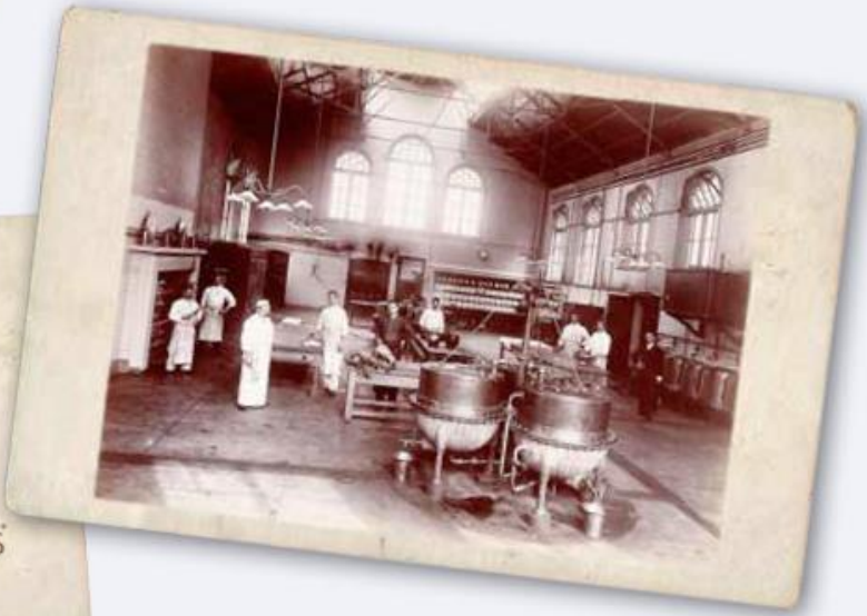
▲ Food production in the 1890s

Most jobs in these sectors only involved manual work. There are far more jobs to choose from in these sectors today.